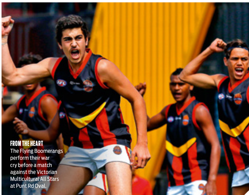
FROM THE HEART The Flying Boomerangs perform their war cry before a match against the Victorian Multicultural All Stars at Punt Rd Oval.

At the end of the annual AFL KickStart Championships, 25 Indigenous players were selected to participate in the Flying Boomerangs Leadership Program.