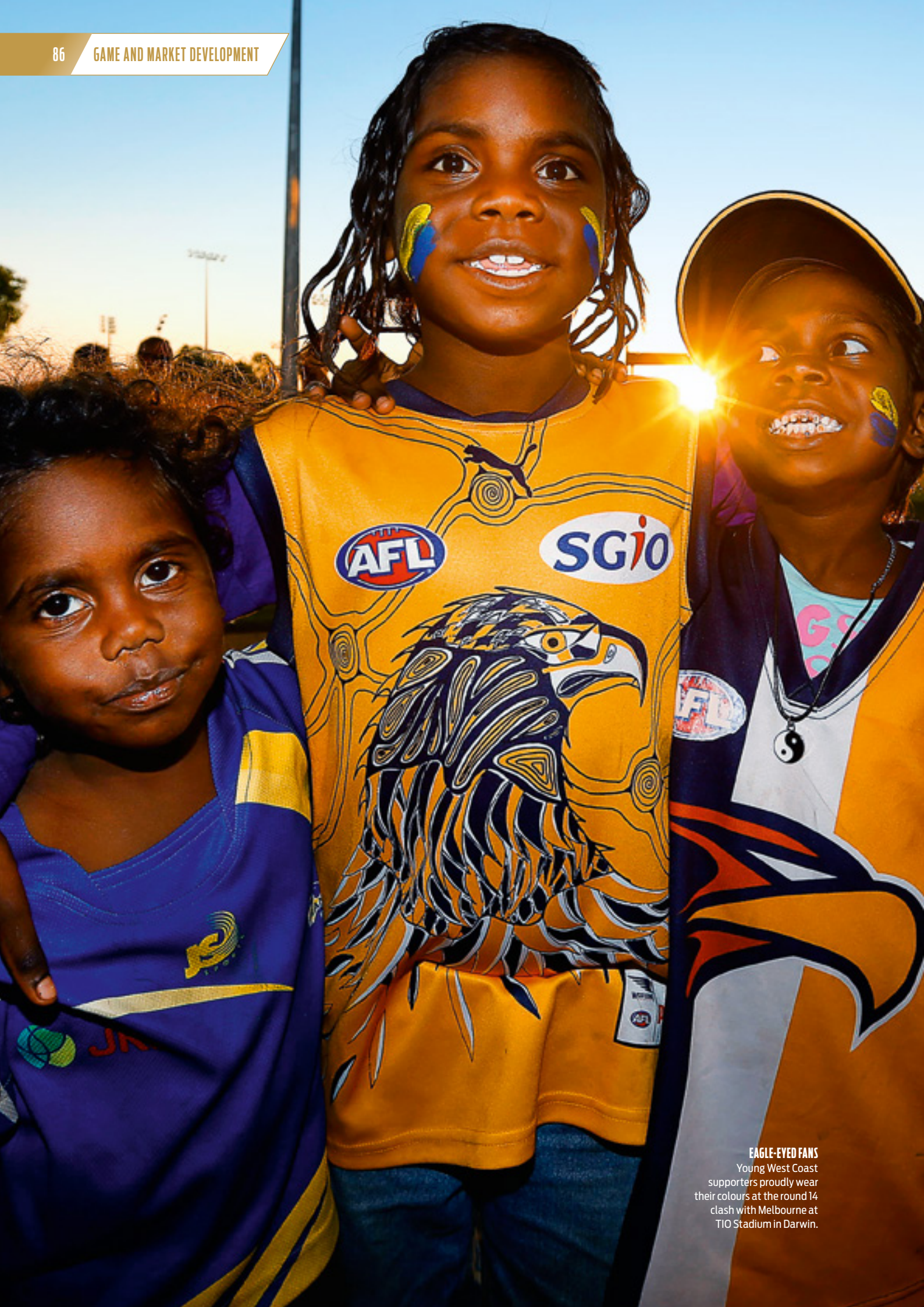
EAGLE-EYED FANS Young West Coast supporters proudly wear their colours at the round 14 clash with Melbourne at TIO Stadium in Darwin.

partner the National Australia Bank for the tremendous support it provides. Through support of the NAB AFL Auskick program, NAB continues to 'Footify' Australia; genuinely growing the game at a grassroots level and supporting tomorrow's stars.