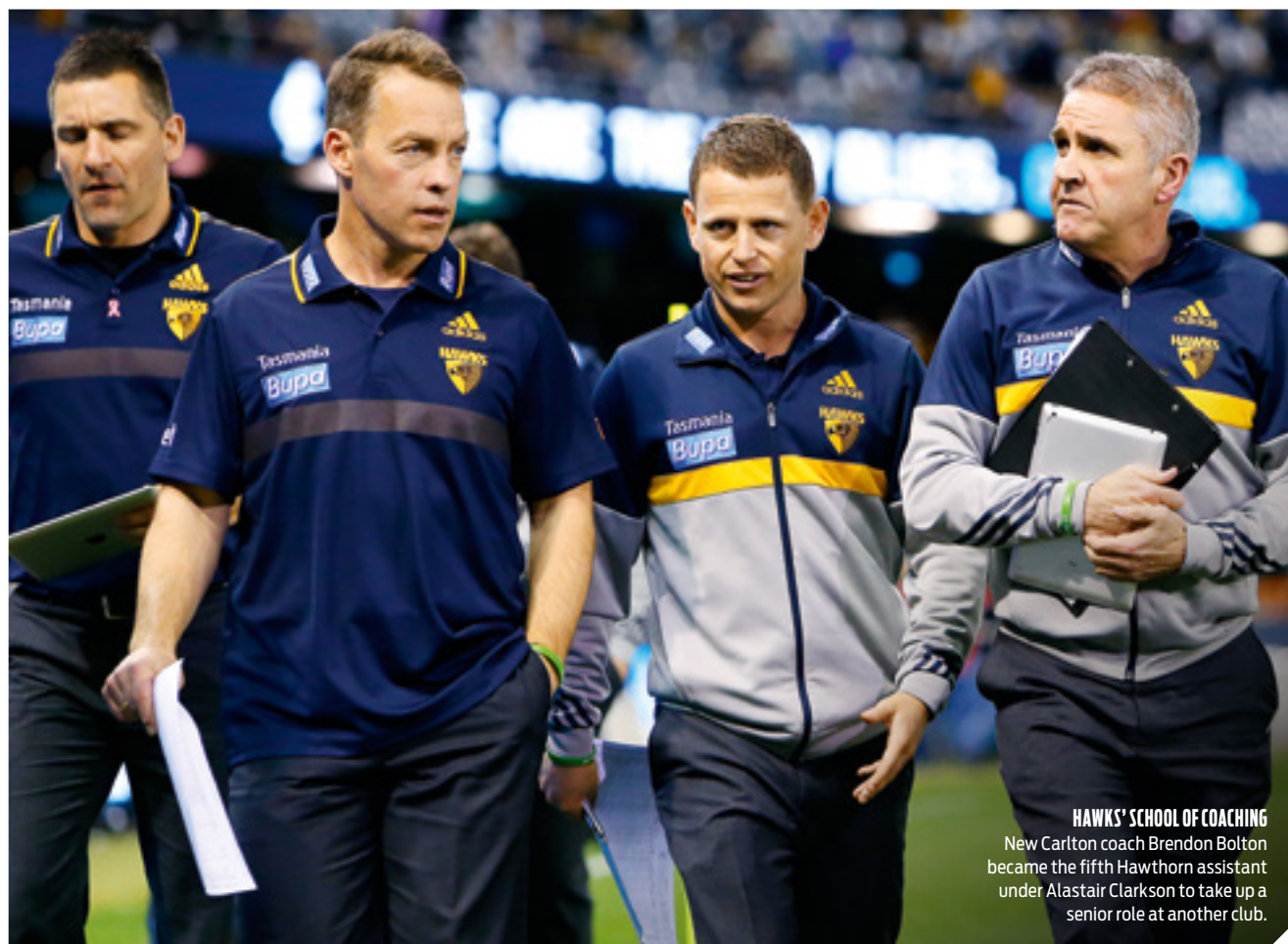
HAWKS' SCHOOL OF COACHING New Carlton coach Brendon Bolton became the fifth Hawthorn assistant under Alastair Clarkson to take up a senior role at another club.