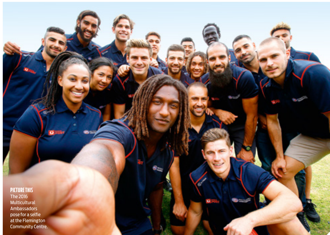
PICTURE THIS The 2016 Multicultural Ambassadors pose for a selfie at the Flemington Community Centre.

The AFL, in conjunction with the AFL Coaches Association, developed an Indigenous Coaching Academy in 2014 to fast-track and further develop Indigenous coaches in the AFL system. In 2015, the academy featured 15 Indigenous coaches who were engaged in education sessions delivered by the AFLCA at the KickStart Championships and the NAB AFL Under-16 Championships respectively. Participants completed Level 2 coaching accreditation and spent a week at an AFL club.